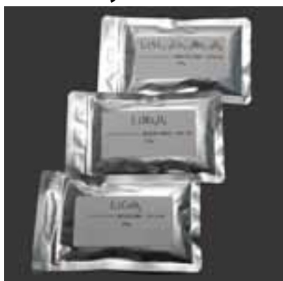
LiCoO 2 , LiMn 2 O 4 , LiNi 1/3 Co 1/3 Mn 1/3 O 2 MCMB, Li 4 Ti 5 O 12 , Si+O, etc.