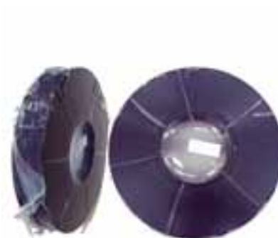
Sealant for Pouch Cells