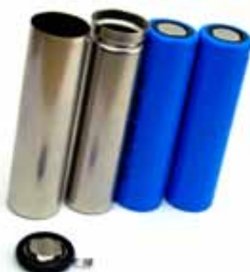
Cylindrical Cans, Rectangular Cans Coin Cans, etc.