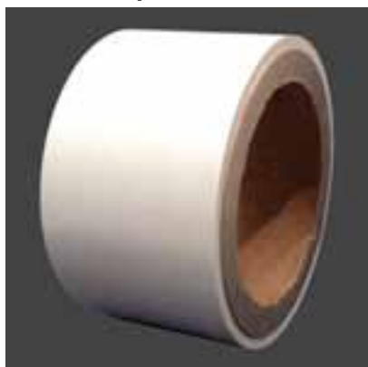
PP, Paper, Aramid, etc